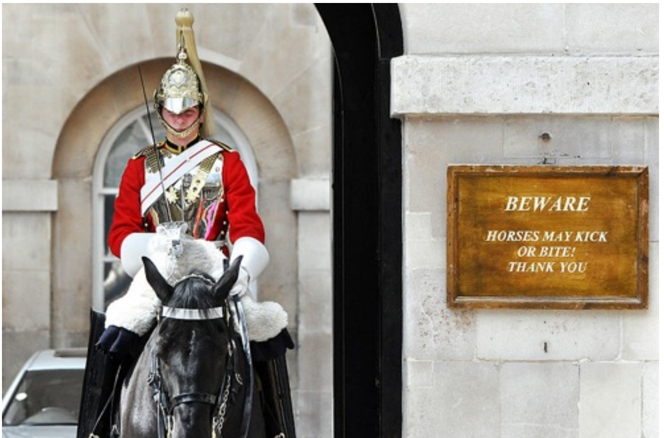
Horse Guards Parade.