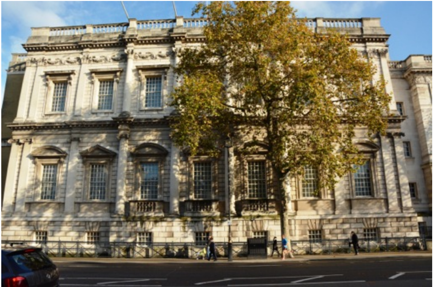
The Banqueting House from Whitehall

4. The Banqueting House is the only surviving building from Whitehall Palace. There is a black dot on the 1680 map. Find out what happened to Charles I here in 1649?