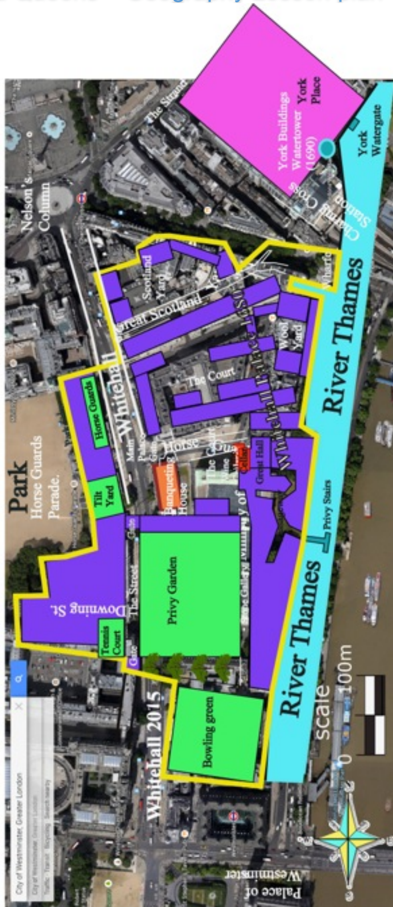
The buildings of Whitehall Palace overlaid on a modern aerial photo (Google)